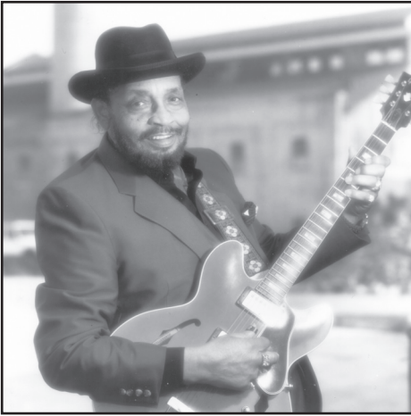
Lowell Fulson (photo courtesy of Hugh Foley).