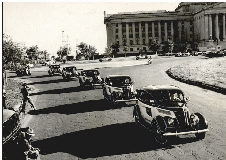
Photo from July 1937 of the newly formed Oklahoma Highway Patrol parading their 1937 Fords in front of the State Capitol (2012.201.B0259.0074,).