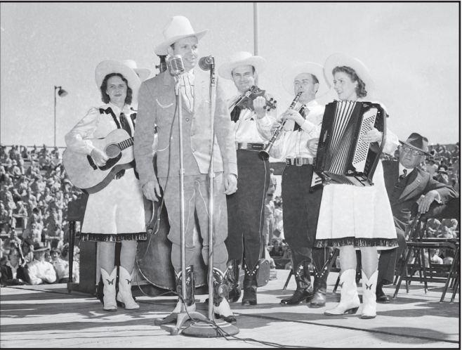
Gene Autry singing in Tulsa in 1941.

The “Music of South Central Oklahoma” concert will be held at the Chickasaw Cultural Center’s Anoli’ Theater at 867 Charles Cooper Memorial Road in Sulphur. Tickets to the concert are $10. The show begins and 7:30 p.m. and popcorn and soft drinks will be provided.