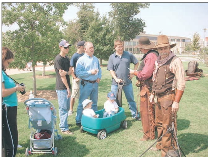
Visitors learned about cowboy culture from SeptemberFest reenactors.