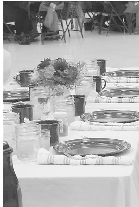
A table setting on display at a past Seay Mansion Society Brunch.