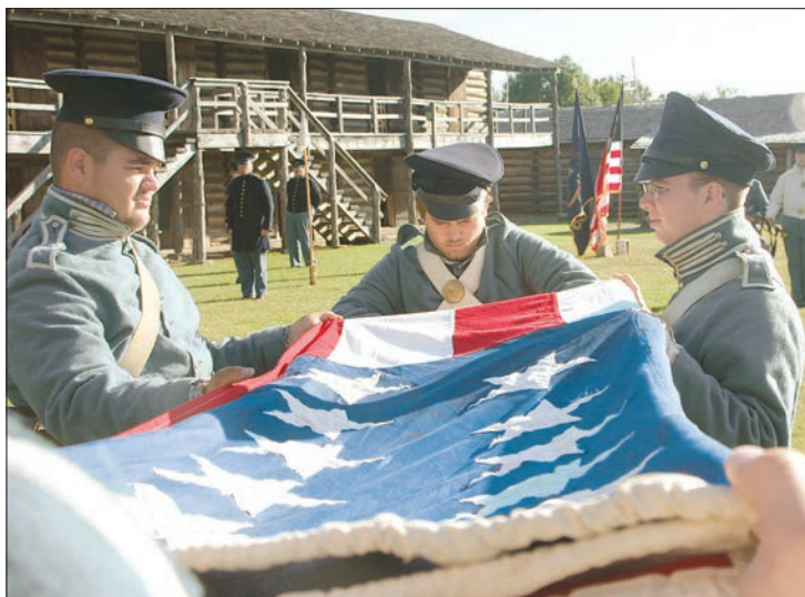
Flag ceremony at 2005 Fall Encampment (Staff photo).

Special admission for Education Day on Friday, October 13 will be $1 each for adults and seniors as well as students. Regular admission resumes Saturday and is $3 for adults, $2.50 for seniors (65 and